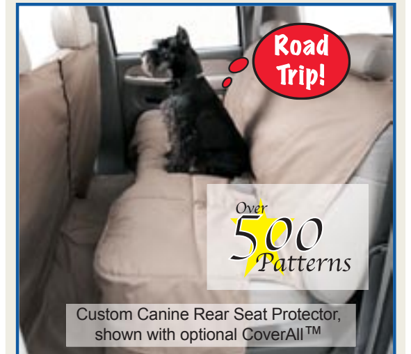
Custom Canine Rear Seat Protector, shown with optional CoverAll™